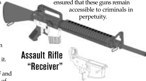
Assault Rifle “Receiver”

show that ATF has repeatedly allowed gun makers to manufacture new banned receivers for anyone who possessed a semiautomatic assault weapon before the Act took effect and whose receivers have been damaged. While assault weapons manufactured before the Act were “grandfathered” and exempted from the law, Congress presumed that these guns would break down over time and vastly reduce the number of these weapons in circulation. ATF’s illegal policy has instead ensured that these guns remain accessible to criminals in perpetuity.